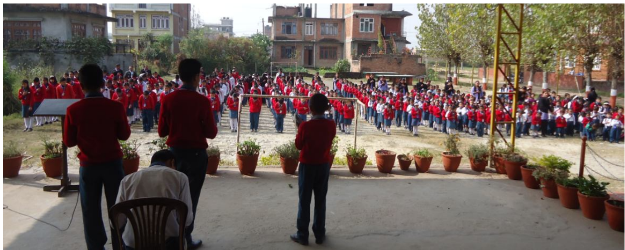
Photos: Students on morning assembly