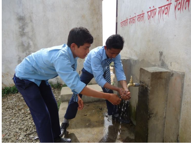
Students drinking water