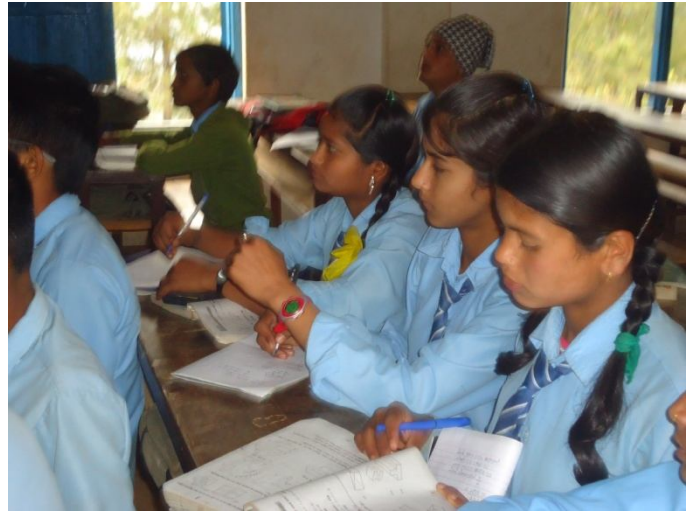
Students in classroom