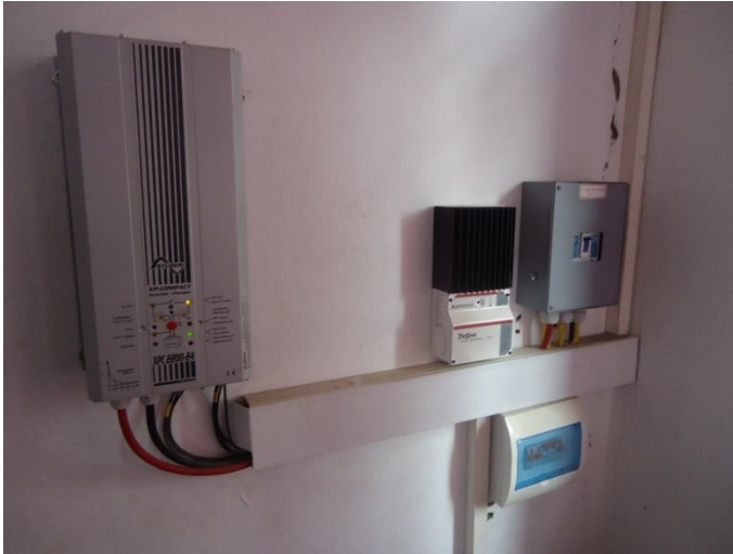
Photovoltaic for alternative energy system