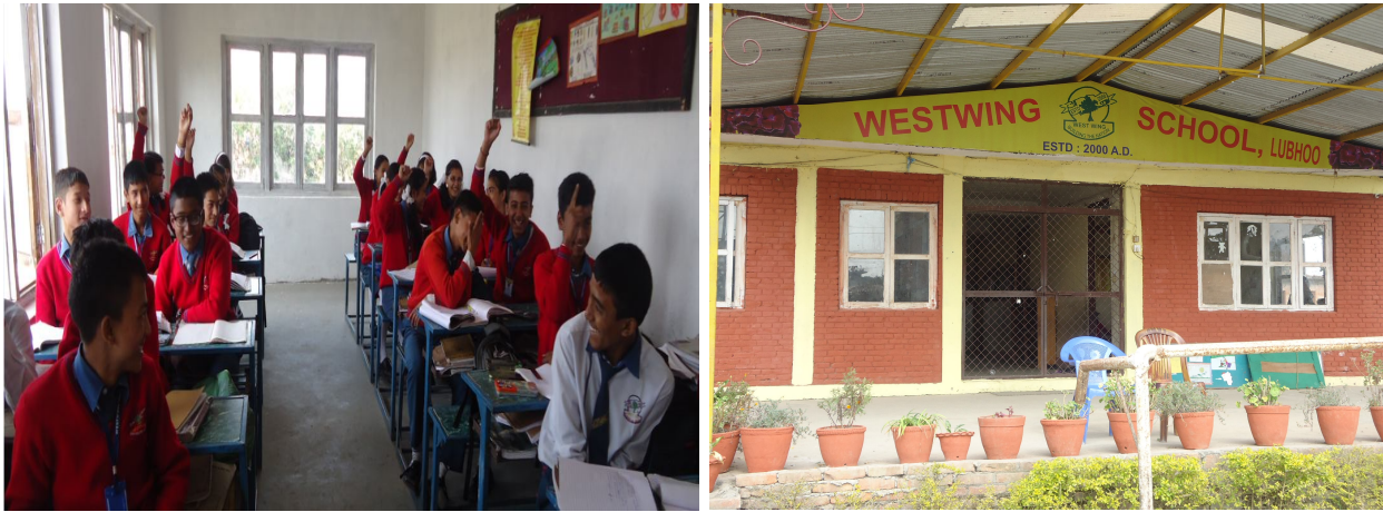
Photos: students in classroom