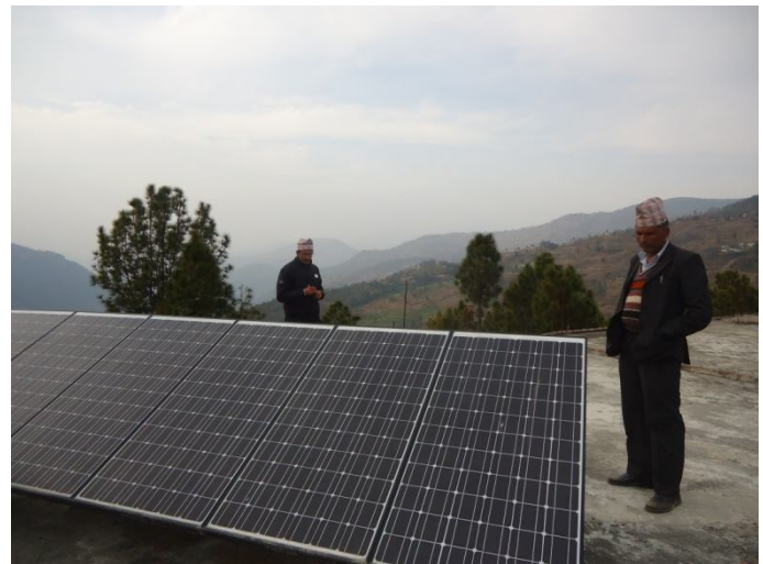
Solar panel on top of Jana Bikash School