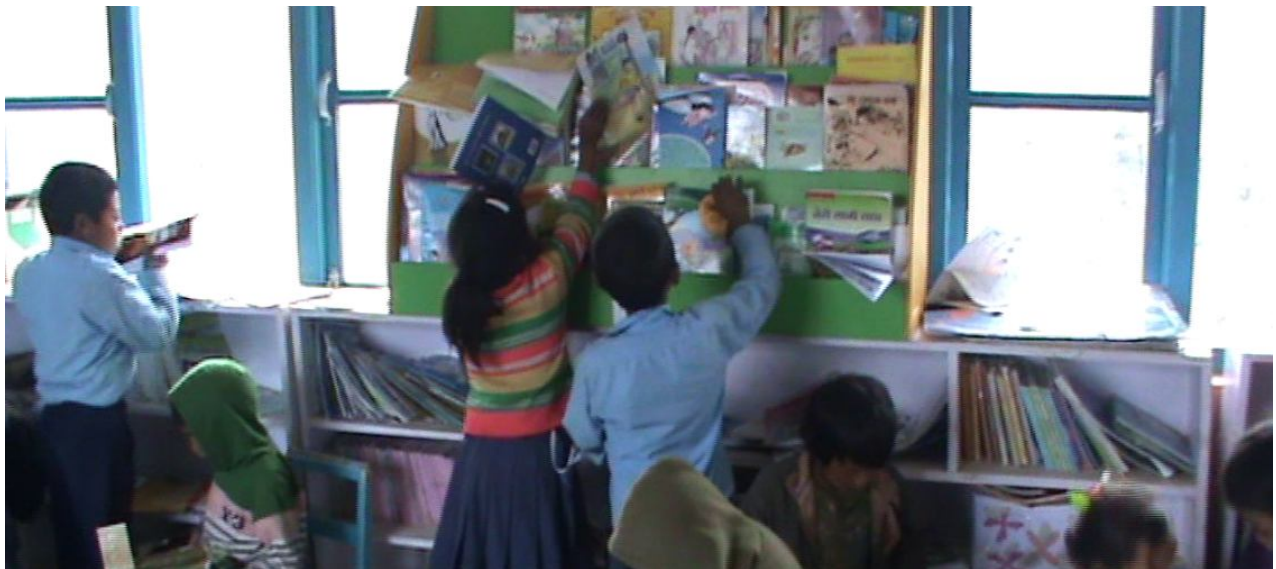
Photo: Children in library