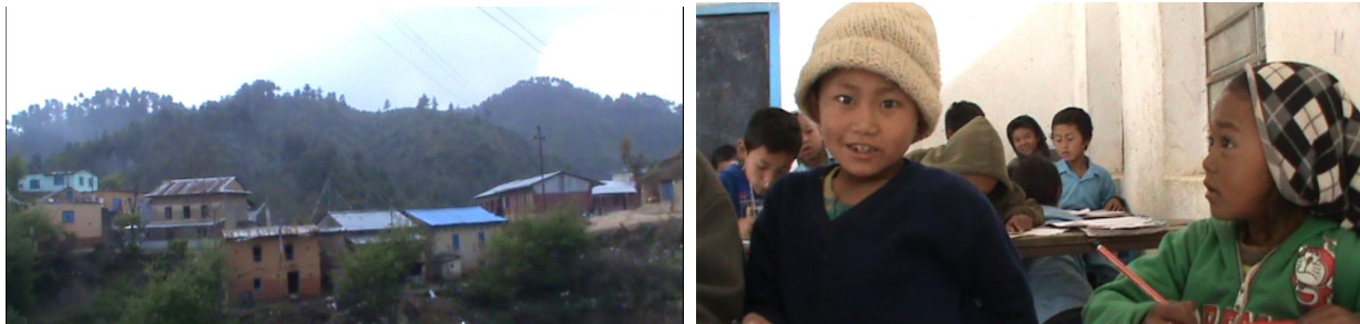
Photos: Lakuri Vhanjyang Village & Students in classroom at Theo School I

School building is in good condition. The principal shared that this school is very popular in this area and helping for needy children. It is known as Theo Fritsche School rather than its own name Basuki School.