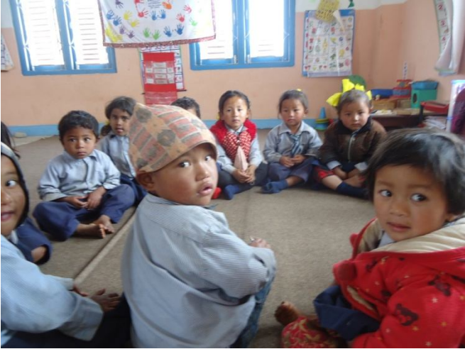
Students in ECD Classroom in new building