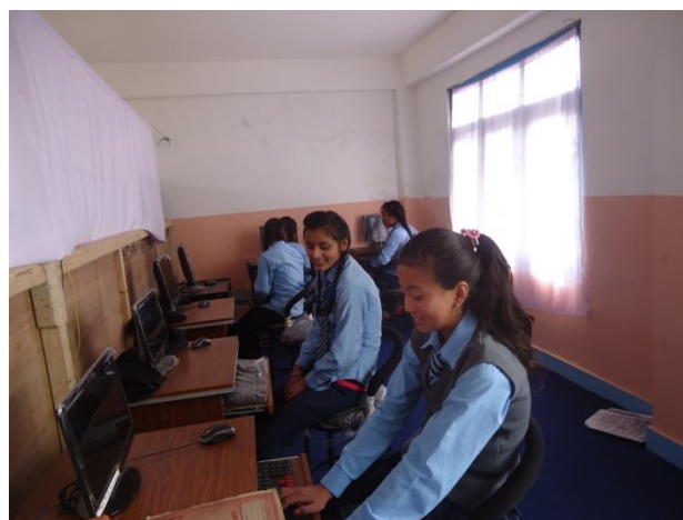
Students in computer classroom